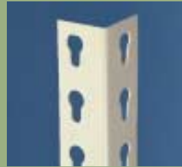
EUR Standard Upright Post