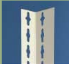
HUR Heavy Upright Post

Match posts with your needs: Use HUR posts for your most demanding applications. Use EUR for light or medium weight applications and in conjunction with ZTP posts. Use ZTP as an intermediate common "T" post.