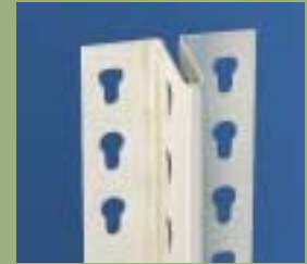
ZTP Intermediate Upright Post