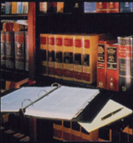
Strength & Beauty