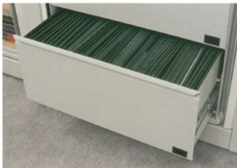
Above: 10 1/2"-high Rollout Drawer with side-to-side top-tab files.