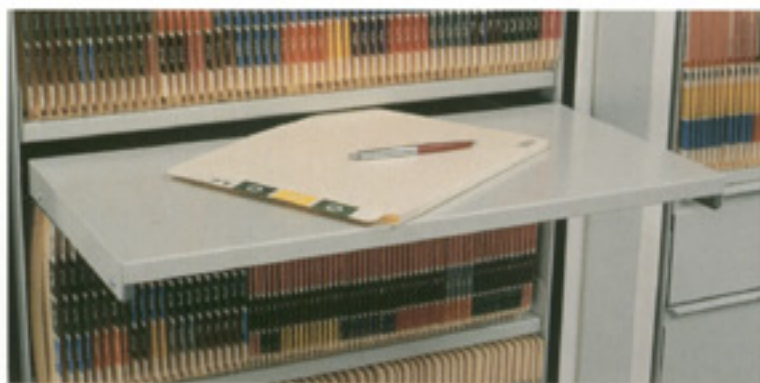
Above: The Pullout Reference Shelf provides a convenient place for reviewing files right at the cabinet.

If your filing space problems can be solved with ARC Rotary Files, why not take action now? Just call and ask for a copy of our Filing System Survey. After you complete the Survey and fax it back, our filing experts will lay out your filing area for maximum efficiency. If needed, they can also design a new end-tab filing system specifically for you, all at no charge. For more information, call 1-800-368-3275.