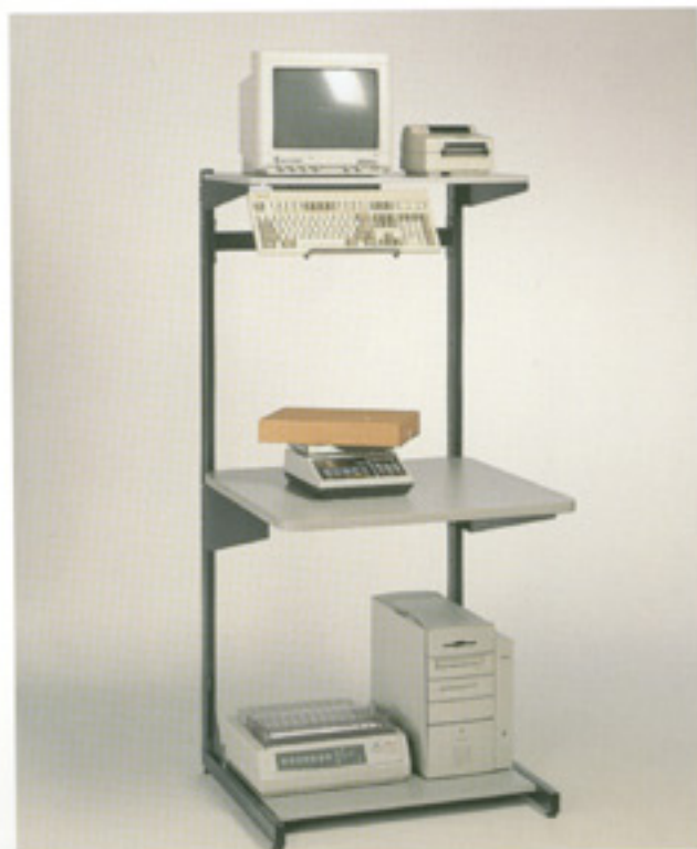
30"-wide Shipping Station, SW30, 64"H x 30"D. Worktop is 30"W x adj. H x 30"D; upper shelf is 30"W x 18"D.