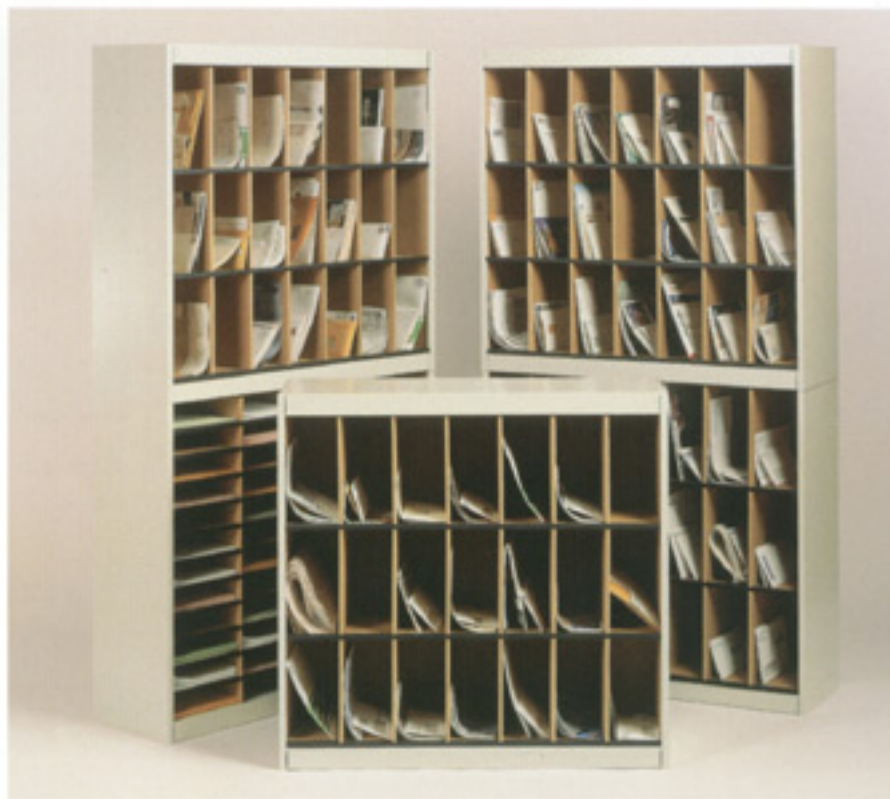
VertiPocket Sorters all 37 3/4"W x 12 3/4"D; SRF3837, 21 pockets, 37"H; SRF3871, 42 pockets, 71"H; SRFC3871, 69 pockets, Combination Sorter, 71"H.