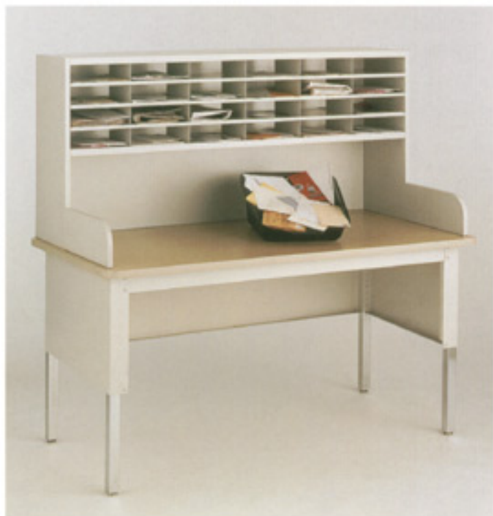
1-Tier Sorter with Riser, SR5827R, 58"W x 27"H x 12"D; Dump Rails, DR2; Work Table, TB60, 60"W x 30"D x 29"-36"H.

60" by 30" steel work table with top of thermally-fused melamine with T-molding edge; adjustable height (29"-36") provides for seated or standing sorting operations. Sturdy chrome-plated 1 1/2" square 16-gauge tubular steel legs with leveling glides. Add shelf with 12" clear opening for bulk storage, and laminate dump rails to prevent mail from spilling. Pebble Gray or Sand; Birch top.