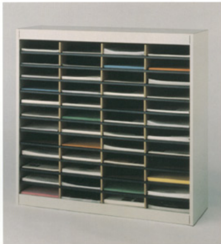
Orion Series, LTF3837, 37 3/4"W x 36 1/2" H x 12 3/4"D.