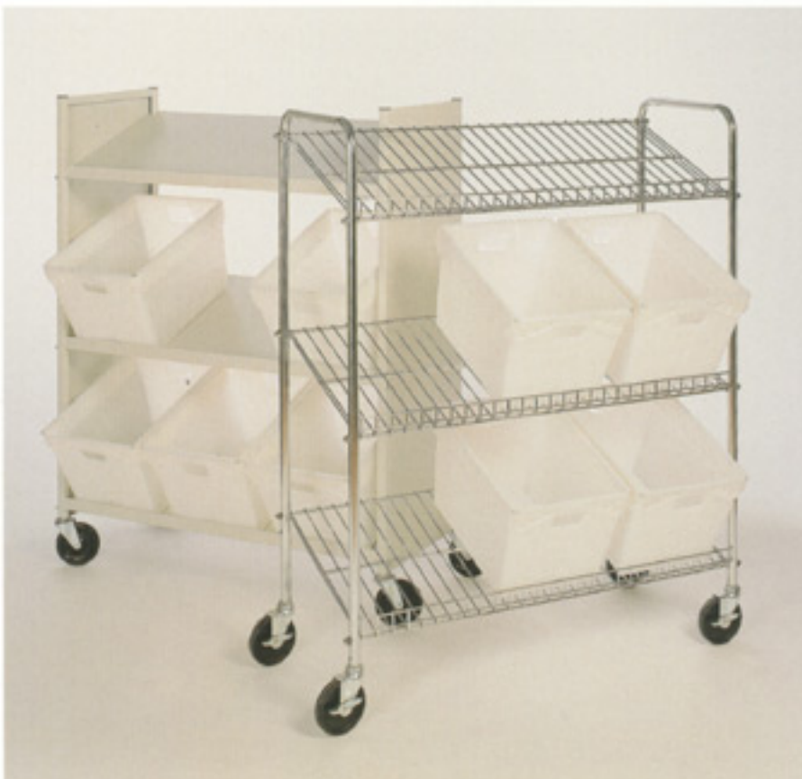
Tote Carts, CTT1 on left, CTT2 on right. Both are 43 1/2"W x 18"D x 55"H, holds 9 totes.