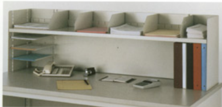
High-Profile Organizer, ORA5818, 58"W x 12"D x 18"H.