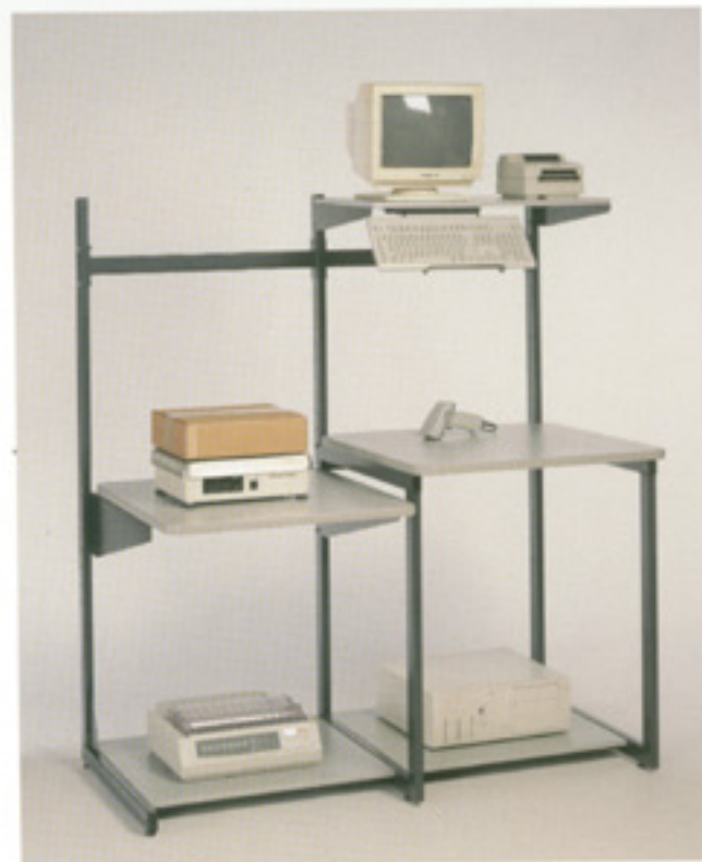
60"-wide Shipping Station, SW60, 64"H x 30"D. Worktops are 30"W x 30"D; worktop on right with 36"H, worktop on left adj. H; upper shelf is 30"W x 18"D.