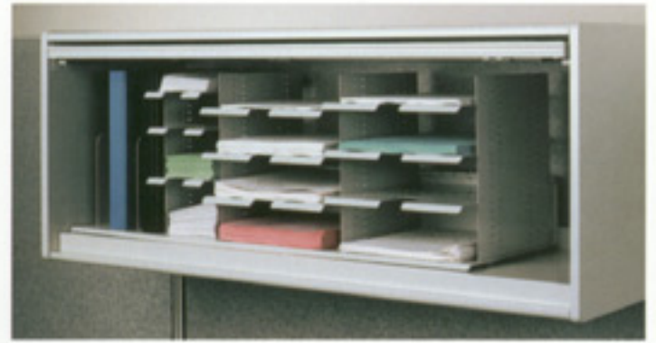
Administrator's System, KB3312E, 33"W x 12"D x 11 3/4"H with 8 10"W and 4 5"W pockets, 2 dividers.