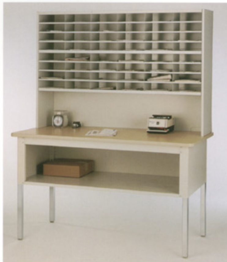
2-Tier Sorter with Riser, SR5840R, 58"W x 40"H x 12"D, on Work Table, TB60, with Shelf, SLF60, 60"W x 30"D x 29"-36"H.