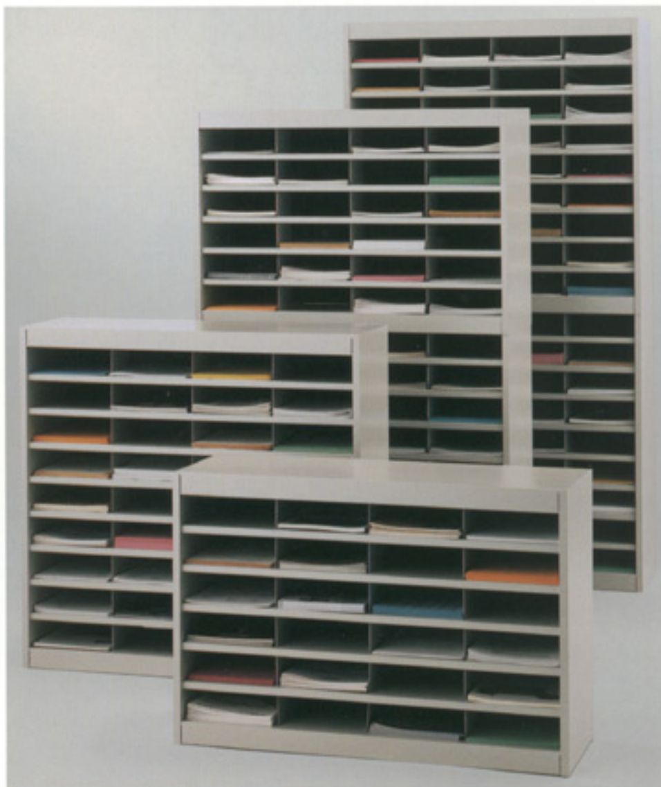
Alpha Series, all 37 3/4"W x 12 3/4"D; LT3826, 25 3/4"H; LT3837, 36 1/2"H; LT3860, 60"H; LT3871, 71" H.