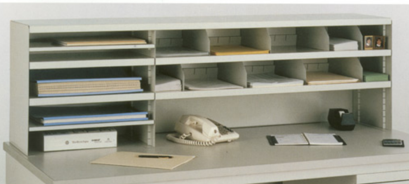
Multi-Pocket Organizer with top shelf, ORBT5818, 58"W x 12"D x 18"H.

Organize your work area for more productivity without sacrificing desktop space. 12" clearance under shelf. Five dividers and three corner shelves, all adjustable. 58" wide shown (47" wide available, four dividers); 18" high, 12" deep; Pebble Gray or Sand. Rugged steel construction, baked enamel finish, ready to assemble.