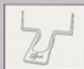
Use Smead Copy Claw (Item No. CC1).

For perfect label positioning on ColorBar® Folders, use our unique ColorFit™ Label Alignment System: