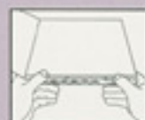
Wrap label around to back side of folder.

For perfect label positioning on standard folders, align the label flashing with the curve of the folder tab: