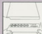
Folder should be open and inside facing up.