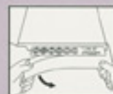
Peel remaining label backer from rest of label.