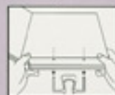
Stack ColorBar folders on posts through holes.