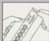
Peel top half of backing off ClickStrip label.

For perfect label positioning on standard folders, align the label flashing with the curve of the folder tab: