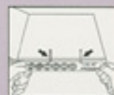
Align notches in label with Copy Claw posts.