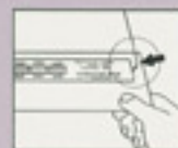
Position the label alignment tab with the folder tab.