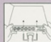
Lift folder with applied label off of Copy Claw.