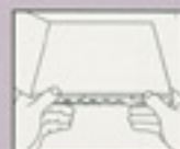
Wrap label around to back side of folder.