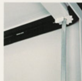
The Marcadet gear-wheel / door-guide system permits the door to open horizontally for easier use and, thanks to fewer moving parts, smoother, quieter operation.

The key to the Marcadet cabinet's appearance, security and function is the unique, lockable tambour door. The horizontally-opening door's narrow, vertical panels provide a touch of elegance to the office environment, while the