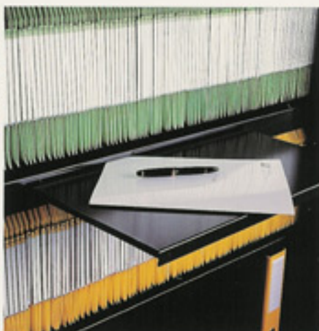
The optional reference shelf provides a convenient work surface to review information right at the file.

MTM BUSINESS SYSTEMS 1622 Edinger Ave., Suite F Tustin, CA 92780 website: www.thefiling.com 714-258-4000 FAX 714-258-4000