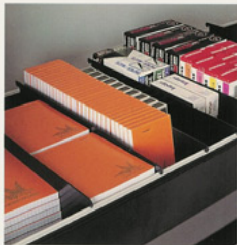
Roll-out drawers give you easy access to cassettes, diskettes, index cards, or office supplies.