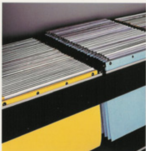
Roll-out frames accommodate hanging files and provide ideal storage for computer print-outs.