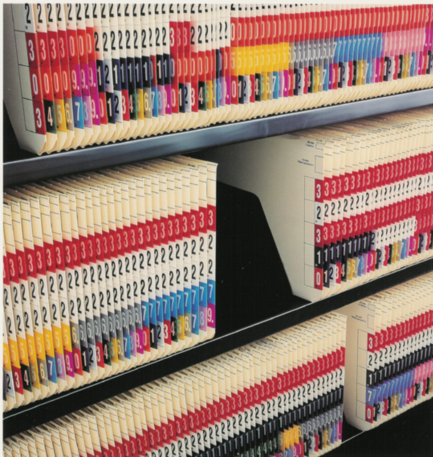
Color-coded, end-tab filing in a Marcadet cabinet offers you maximum efficiency for both filing and retrieval.

With a Marcadet cabinet, superior function leads naturally to superior form. Kwik-File designs and builds each cabinet both to enhance your office environment and to give you years of use, all with the security that only a locked door can offer.