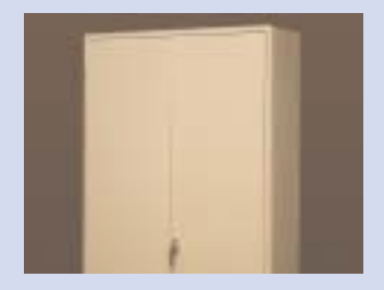
Hinged Door Assembly Converts 36", 42" and 48" wide closed units into a dust free and secure* cabinet.