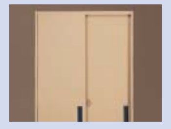
Sliding Single Door Assembly Single sliding door offers lockable security* for 36", 42" & 48" wide cabinets.