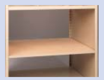
Particle Board Shelves An economical alternative to steel shelves. Available plain or with a light oak grain finish.