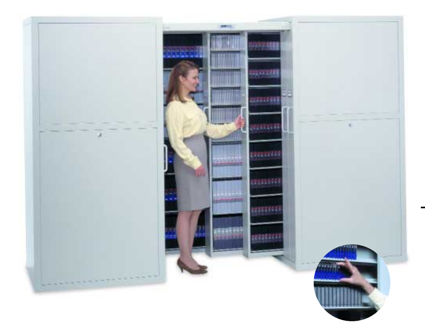
EASY ACCESS Shelf design (patent applied for) features built-in "finger gap" for ergonomic access.