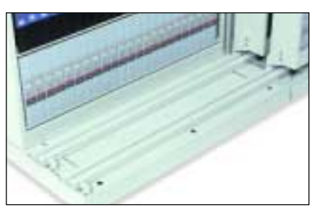
EASE OF MOVEMENT Oversize Teflon wheels roll smoothly and easily.

Avoid endless hours of leveling and releveling. Slidetrac bases have 6 individual leveling glides that are accessible from the top.