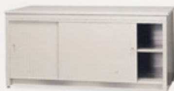
Base Cabinet table shown with optional intermediate shelf.

Console tables adjust in height from 28 to 36 inches. Side and back panels are 22 inches long to provide 19 inch shelf access clearance on models with bottom shelf. Console tables are compatible with all Mail Master drawer units.