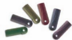
Transponder Programming Keys

Space PRO ® Make a movable carriage stationary on a permanent or temporary basis; adjust aisle width; make a single aisle or a group of aisles secure with limited access. Advanced RF transponders put these features at your fingertips with, no special equipment or training.